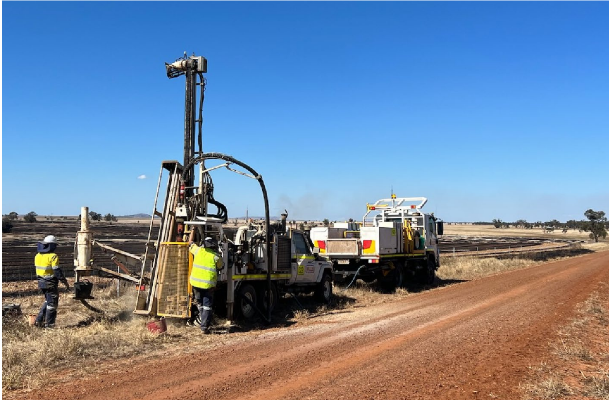
Figure 1 – Air-core rig drilling at the O’Connor’s zone at Yeungroon.

Based on preliminary pXRF results, a large-scale, open-ended arsenic anomaly has been defined and is associated with the north-northeast trending O’Connors fault and associated splay faults. The anomaly extends for over 3 km, remains open along strike, and appears to have a wider footprint than first anticipated. In addition, several zones of arsenic anomalism to the west of the O’Connors target zone has been identified (Figure 2). Based on these results, zones with anomalous arsenic are being carefully reviewed by company geologists and selected samples are being dispatched to the SGS Assay laboratory for gold analysis by fire assay. The pXRF instrument does not reliably measure gold concentration, therefore secondary laboratory-based analyses for gold are required.